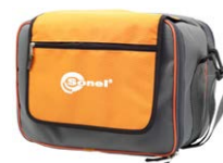
L4 carrying case