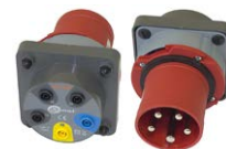
Three-phase socket adapter 63 A