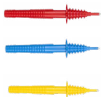
Pin probe 1 kV (banana socket) red / blue / yellow