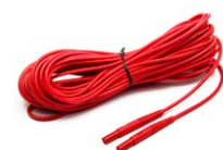
Test lead 5 / 10 / 20 m red 1 kV (banana plugs)