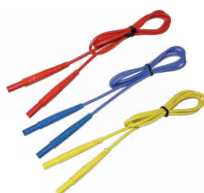
Test lead 1.2 m (banana plugs) red / blue / yellow