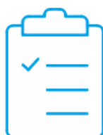
Calibration certificate with accreditation