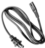
Mains power cable Euro 2-pin plug / IEC C7 plug