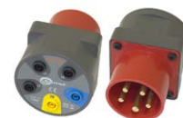
Three-phase socket adapter 16 A / 32 A