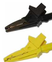
Crocodile clip 1 kV 20 A black / yellow