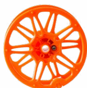
Test wire reel