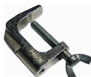
Cramp with banana socket