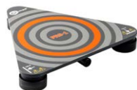
PRS-1 resistance test probe