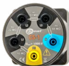
CS-1 cable simulator