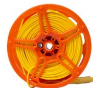
Test lead for earth resistance mea- surement 50 m