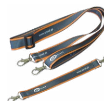
L2 hanging straps (set)