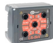
CS-5kV cali- bration box