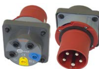
Three-phase socket adapter 63 A