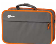
L2 carrying case