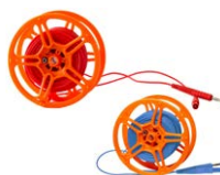
Test lead for earth resistance measurement 25 m red / blue