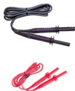
Test lead 5 kV 1.8 m (banana plugs) black shielded / red