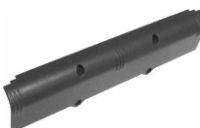
Battery pack 4xLR14