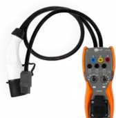
EVSE-01 adapter for testing vehicle charging stations