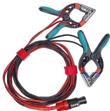
H winding current and sense cables with small TTA clamps

All specifications herein are valid at ambient temperature of +25 °C / +77 °F and standard accessories. Specifications are subject to change without notice.