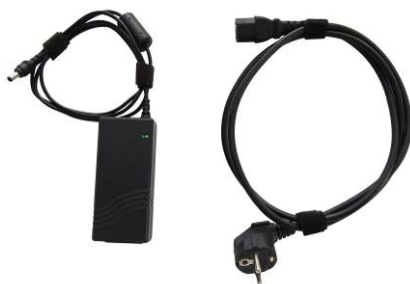
Mains power cable with power supply adapter 18 V / 3 A