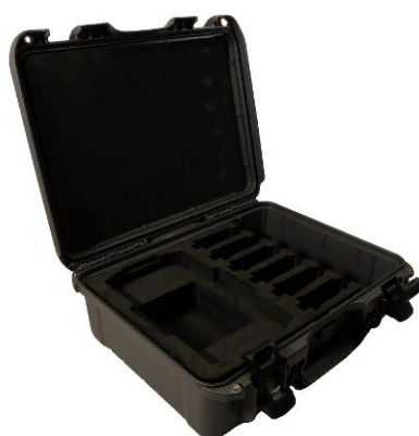
Plastic transport case for TWR-H, TRT-H & RMO-TH