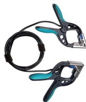
Jumper cable with small TTA clamps