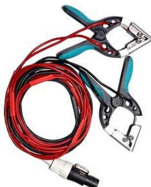
X winding current and sense cables with small TTA clamps