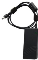
Mains power cable with power supply adapter 18 V / 3 A