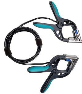
Jumper cable with small TTA clamps