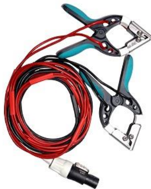
X winding current and sense cables with small TTA clamps