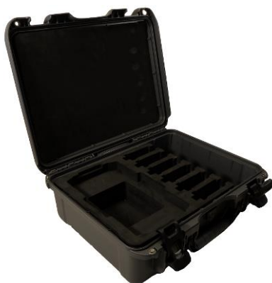
Plastic transport case for TWR-H, TRT-H & RMO-TH