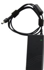
Mains power cable with power supply adapter 18 V / 3 A