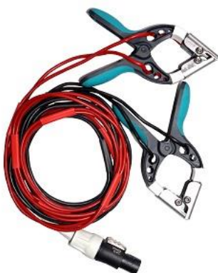
X winding current and sense cables with small TTA clamps